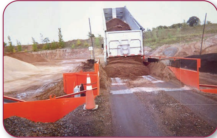
Drive Over Unloader can be used with standard belly dumps as well as end dumps