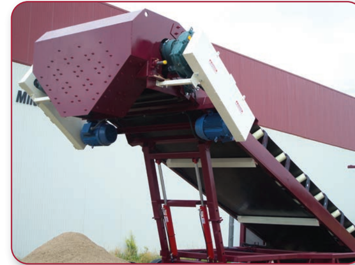
Variable Height Hydraulic Raise, Heavy Duty Hood w/ Optional Wear Plates