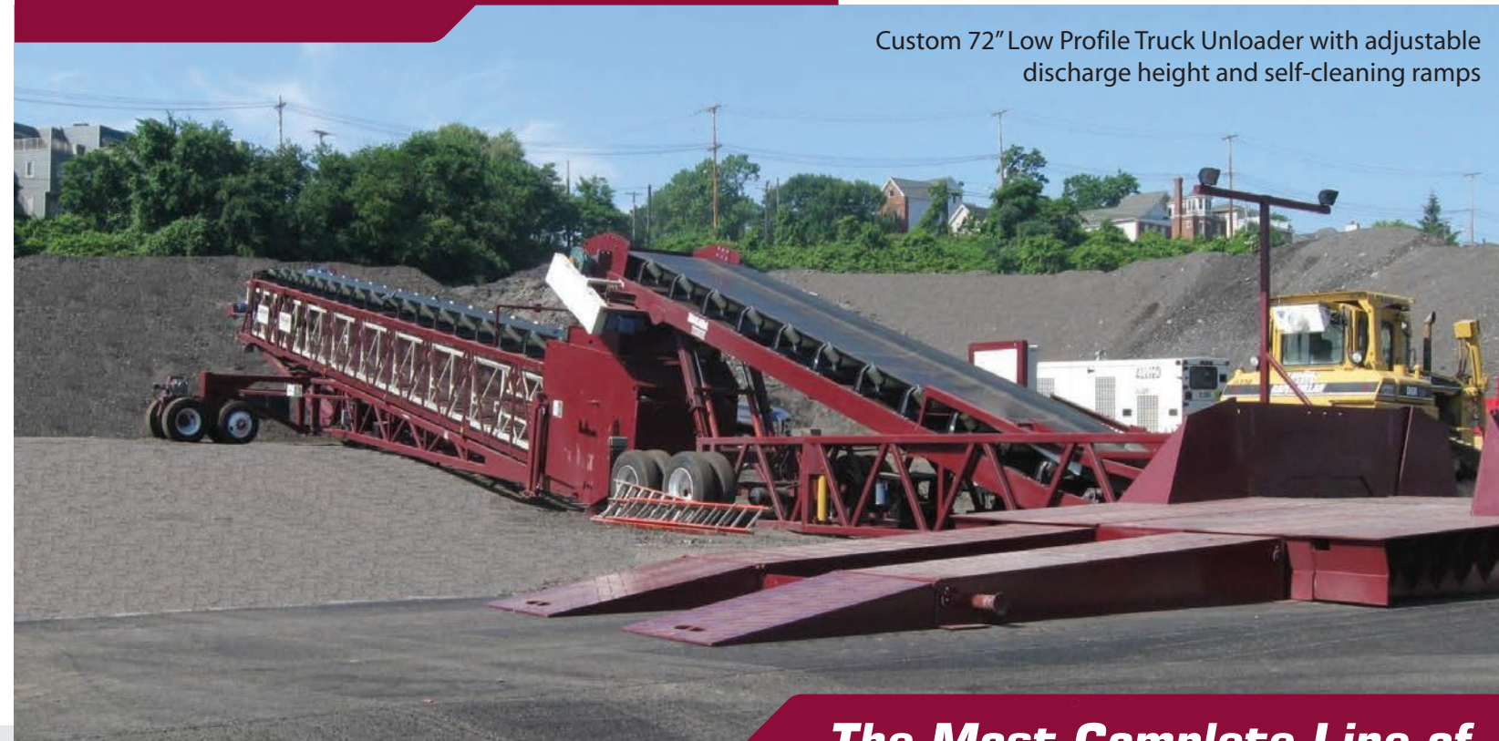
Custom 72" Low Profile Truck Unloader with adjustable discharge height and self-cleaning ramps

The Most Complete Line of Customized Material Handling Solutions