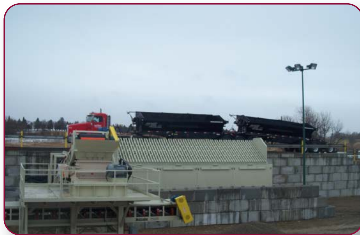
Stationary Side-Dump Truck Unloader