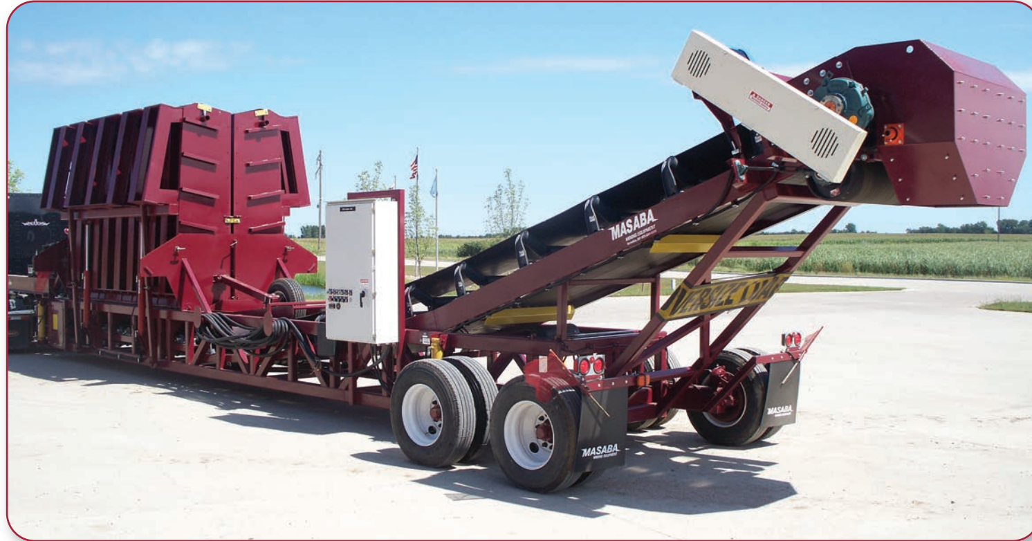
Custom 48" Low Profile Truck Unloader with fixed discharge height – shown in road travel position