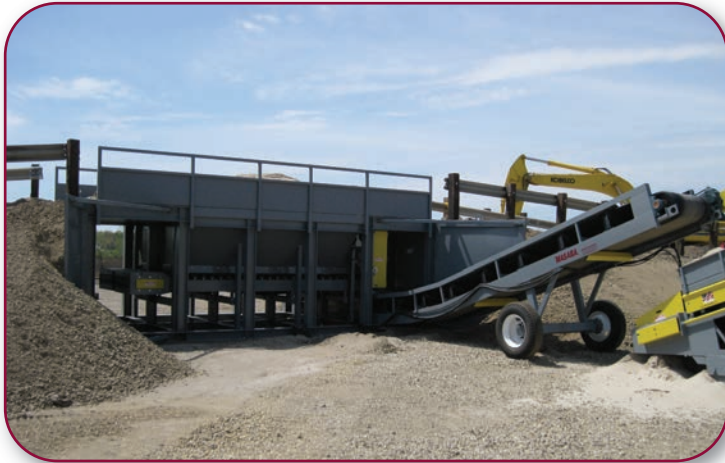
Stationary Drive Over Truck Unloader. 1200 TPH capacity with fold out wing walls