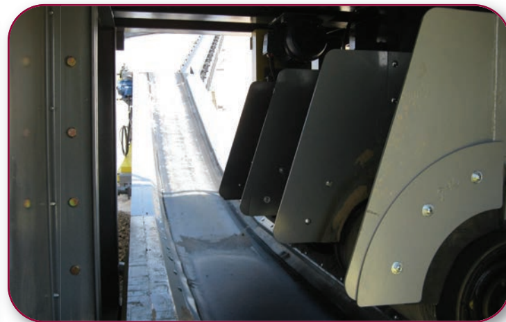
Drive Over Unloader transferring material to stockpile via (2) 36" collecting conveyors and 42" dogleg conveyor