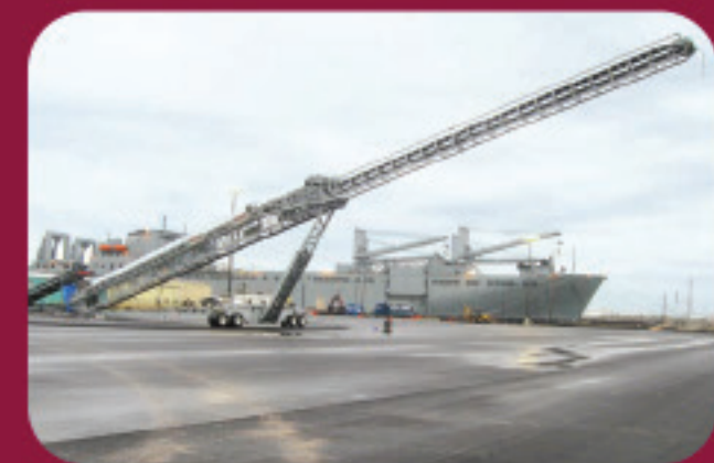
36" x 190' MAGNUM Telescoping Conveyor