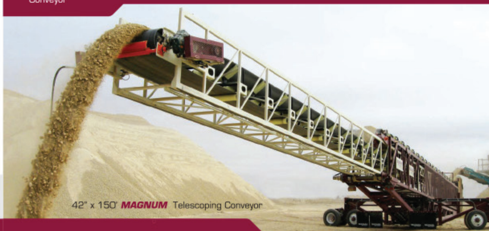
42" x 150' MAGNUM Telescoping Conveyor