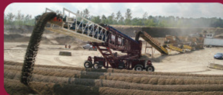
36" x 150' MAGNUM Telescoping Conveyor

1617 317th Street • PO Box 345 • Vermillion, SD 57069